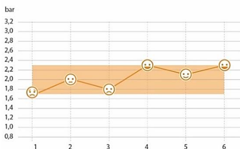
Settings vary according to patient's condition